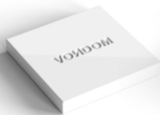
Opaque White PC 4105