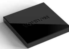
Opaque Black PC 4104