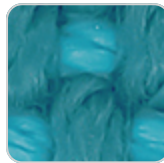
aquamarine 10003 getaria

Premium high density 100% acrylic fabric, available in a wide range of colors.