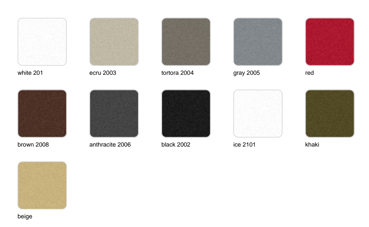
LIGHT Ref. 55015W

Matt polyethylene. Includes white ambient light either with white LED.