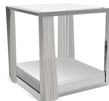
1 x 54183F Pégola Canopy 1 x 54107 Daybed Basic