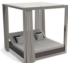
1 x 54183F Pégola Canopy 1 x 54180 Daybed 2 cabezales recilnables Daybed 2 reclining backrest