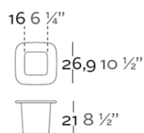
MOMA Bucket MOMA Cubitera